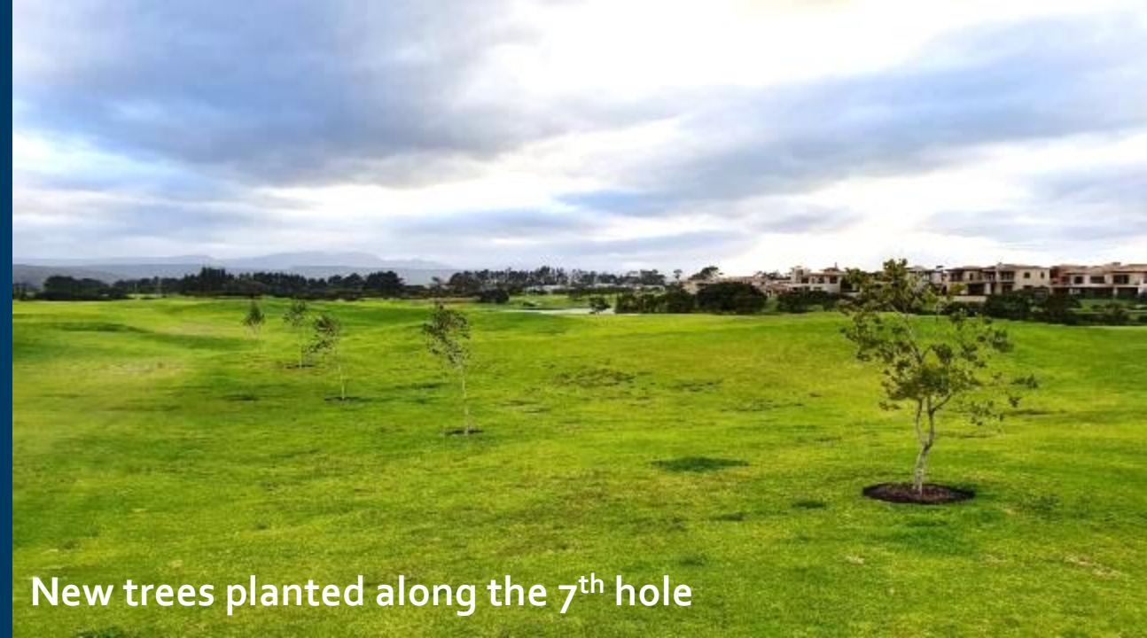
New trees planted along the 7 th hole