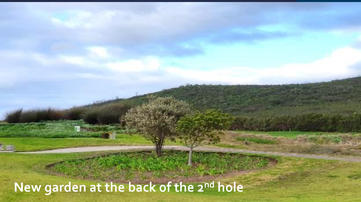
New garden at the back of the 2 nd hole

To celebrate the start of Spring, we have planted 25 new trees around the course and created new gardens on the 2 nd hole as well as next to the 8 th tee box.