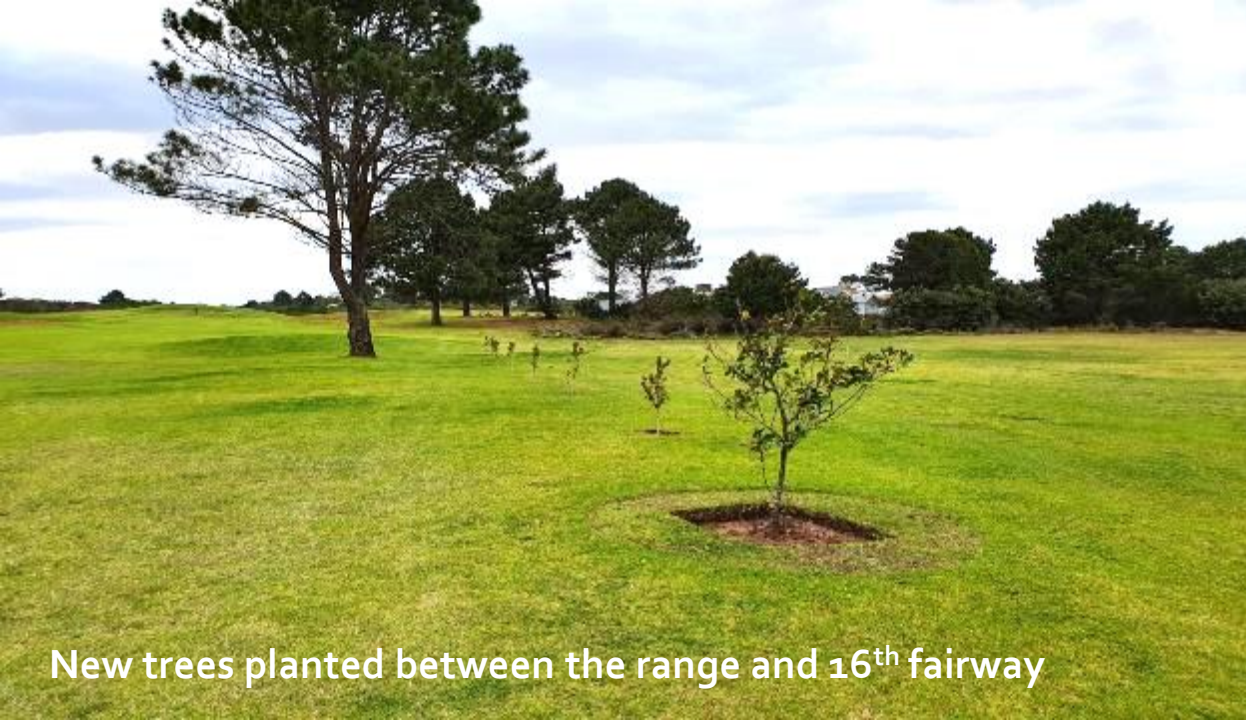
New trees planted between the range and 16 th fairway