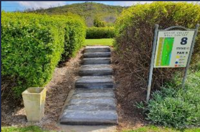
Upgraded steps leading to the 8 th Tee box