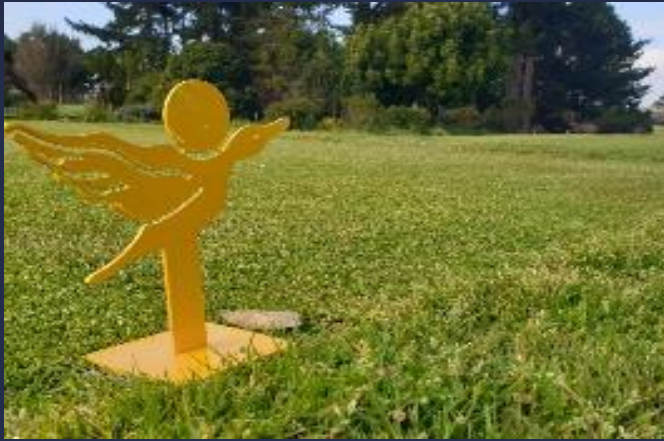
The new Tee Boxes markers